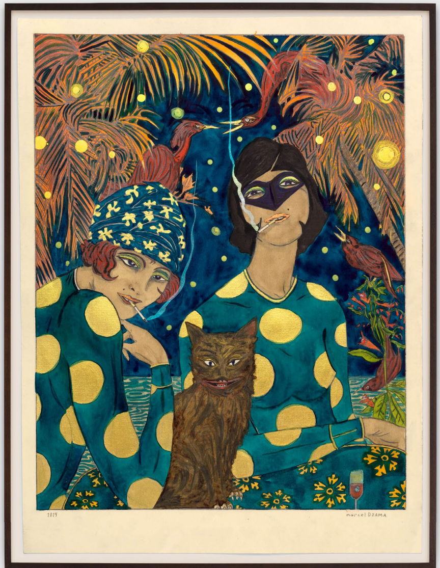
Before I let you take me home (or Lets go for drinks), 2024

acrylic pearl, ink, watercolor, and graphite on paper, 53,5 cm x 40,4 cm