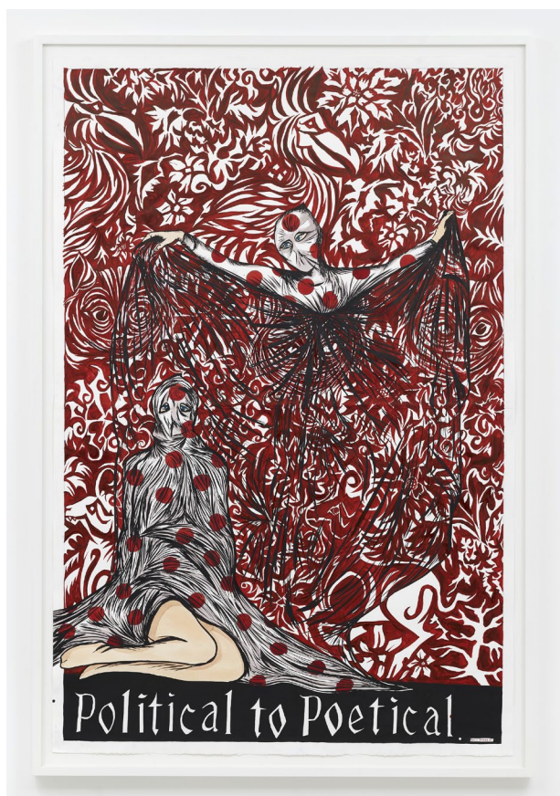
4 faced Joker, 2021

Ink and watercolor on paper 192,4 cm x 126,7 cm © Marcel Dzama courtesy of the artist and Sies+Höke