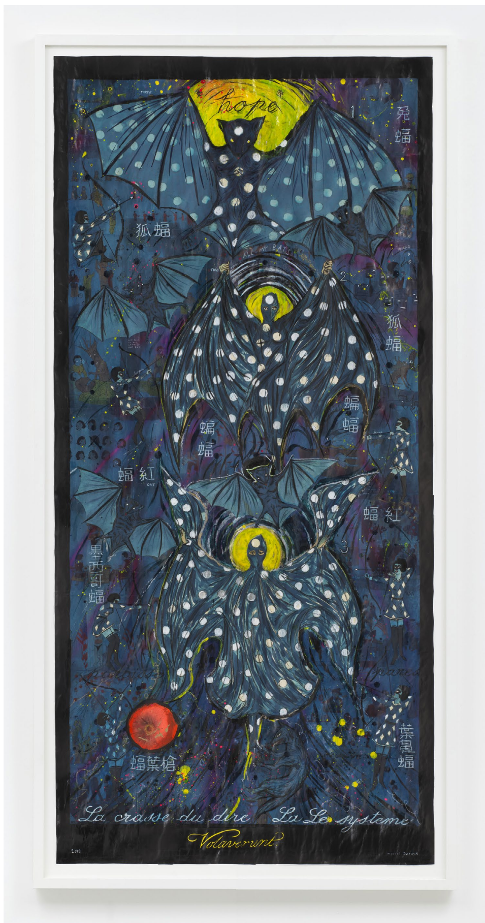
I'll Sleep on the Earth And I'll Fly Once I Wake 2018

watercolor, ink, and graphite on paper, 192,4 cm x 90,2 cm © Marcel Dzama courtesy of the artist and Sies+Höke