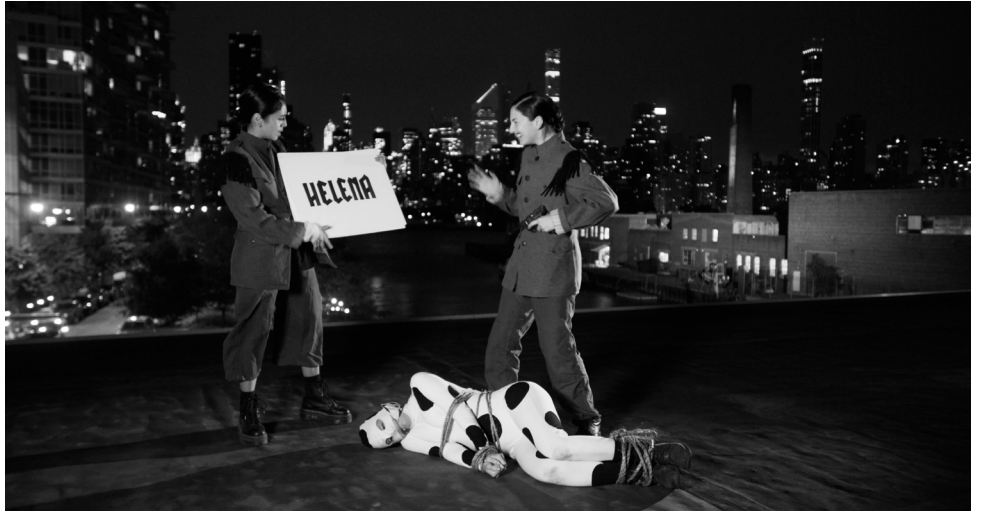
To live on the Moon (For Lorca) , 2023 video projection, sound 25 min 17 sec, variable dimensions 3 editions + 2 artist's editions A Performa commission for the Performa 2023 Biennial, New York © Marcel Dzama courtesy of the artist and David Zwirner